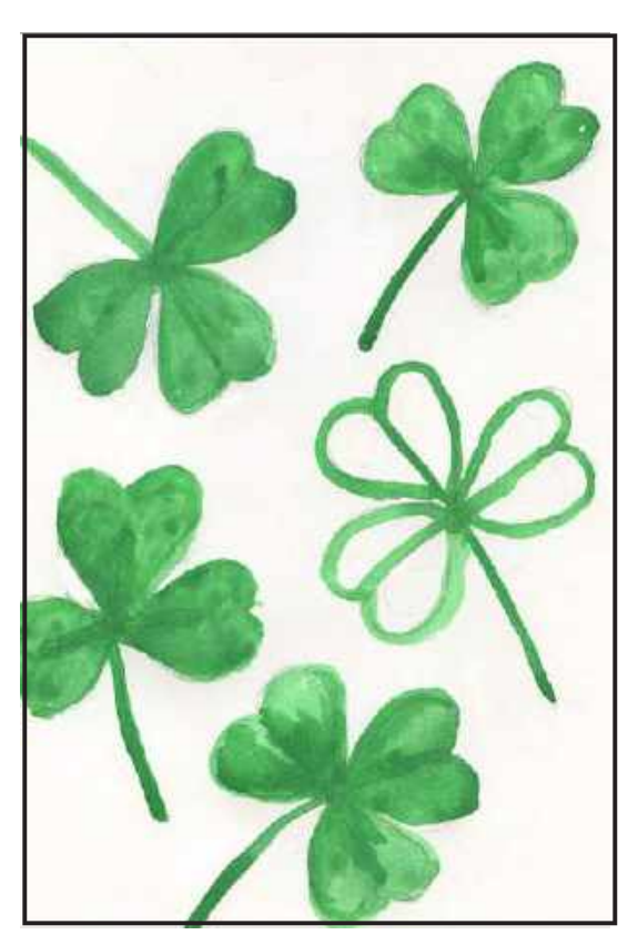
3. Fill shamrocks with dark green color.