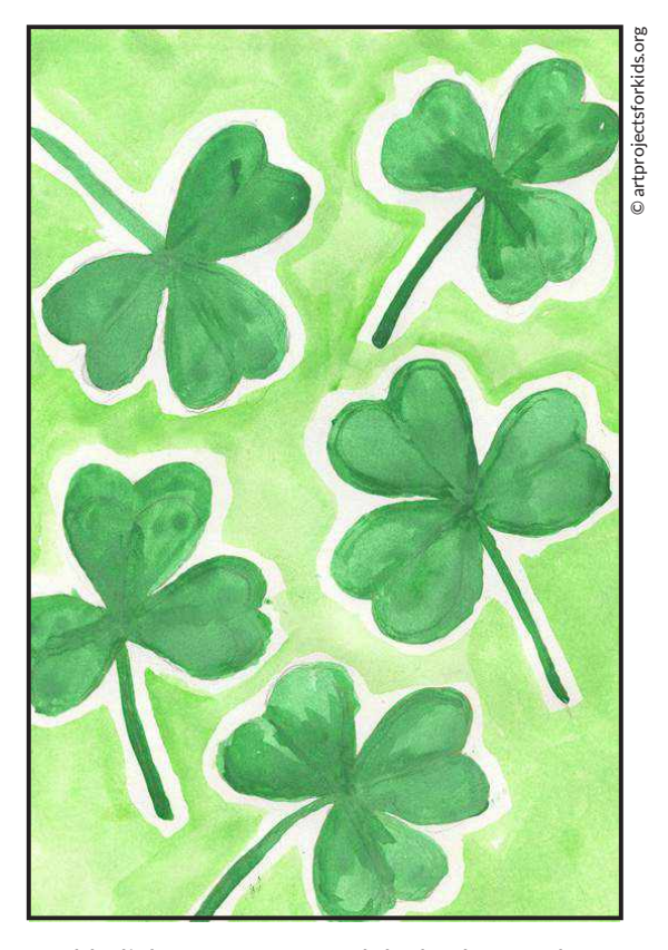
4. Add a lighter green around the background.